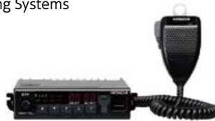
Land Mobile Radio Communication Product