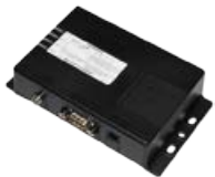
Wireless Packet Communication Unit for Cellular System

Wireless Communication Systems, Information Solutions, Broadcasting Systems, Surveillance Cameras and Video Processing Systems