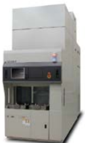
Batch SiGe/Si Epitaxial Growth Equipment