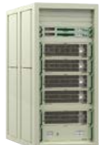
Digital TV Transmitter