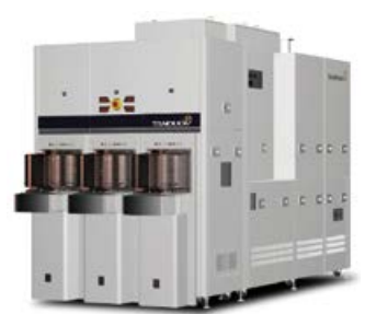
Single Wafer Ashing Equipment