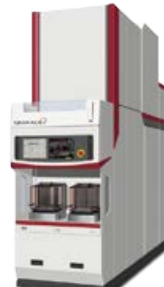
Batch Thermal Process Equipment