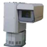
Full-HD Integrated Pan-Tilt Camera