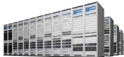
Tapeless Servers System (Server system for broadcasting station operation)