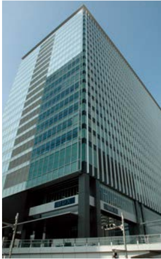
Head Office (Akihabara UDX Building, 11th floor)