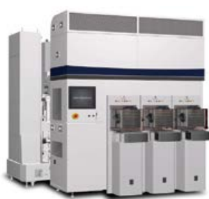
Single Wafer Plasma Nitridation/Oxidation Equipment