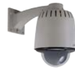
Full-HD Monitor Camera