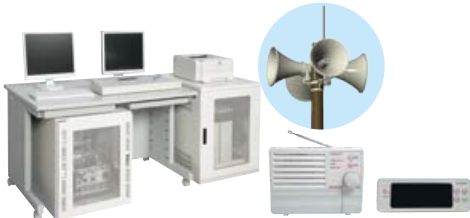
Radio Communication System for Disaster Preventive Administration