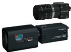
Industrial Video Camera