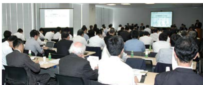
Briefing on the financial results for the term ended March 2016

For institutional investors and security analysts, we organize quarterly briefings on financial results, meetings on individual matters, and other sessions to increase their understanding of our Group.