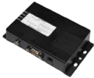
Wireless Packet Communication Unit for Cellular System

Wireless Communication Systems, Information Solutions, Broadcasting Systems, Surveillance Cameras and Video Processing Systems