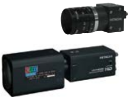
Industrial Video Camera