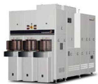
Single Wafer Ashing Equipment