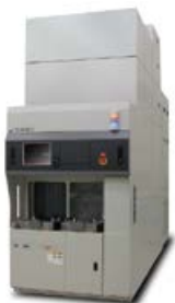
Batch SiGe/Si Epitaxial Growth Equipment