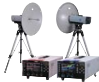
Broadcasting Video Transmitter (Microwave Link)