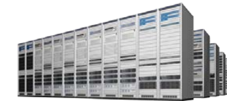
Tapeless Servers System (Server system for broadcasting station operation)