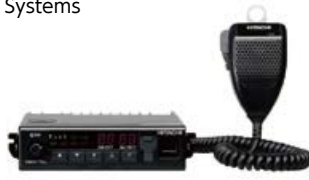
Land Mobile Radio Communication Product