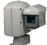
Integrated Pan-tilt Camera for Outdoor Use