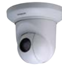
Network-type Monitor Camera