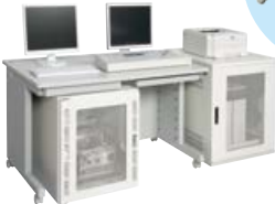
Radio Communication System for Disaster Preventive Administration