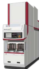
Batch Thermal Process Equipment