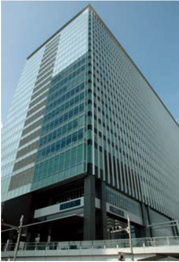
Head Office (Akihabara UDX Building, 11th floor)

Name Hitachi Kokusai Electric Inc. Address of Head office 4-14-1, Soto-kanda, Chiyoda-ku, Tokyo 101-8980, Japan Established November 17, 1949 Paid-in Capital ¥10,058 million Net Sales ¥183,632 million (consolidated) Employees 4,943 (consolidated)