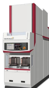
Batch Thermal Process Equipment