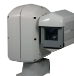
Integrated Pan-tilt Camera for Outdoor Use