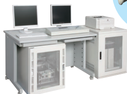
Radio Communication System for Disaster Preventive Administration