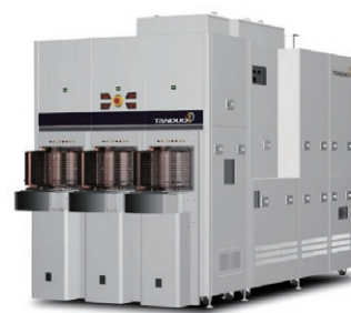
Single Wafer Ashing Equipment