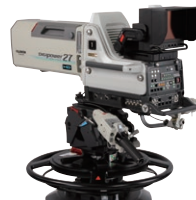
Broadcasting HD Video Camera