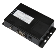
Wireless Packet Communication Unit for Cellular System

Wireless Communication Systems, Information Solutions, Broadcasting Systems, Surveillance Cameras and Video Processing Systems