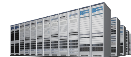
Tapeless Servers System (Server system for broadcasting station operation)