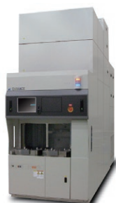
Batch SiGe/Si Epitaxial Growth Equipment