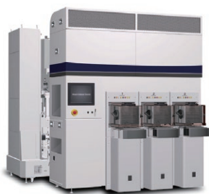
Single Wafer Plasma Nitridation/Oxidation Equipment