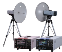
Broadcasting Video Transmitter (Microwave Link)