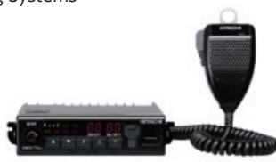
Land Mobile Radio Communication Product