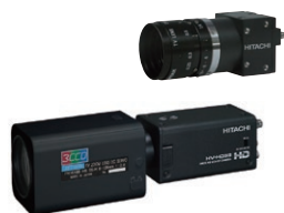
Industrial Video Camera