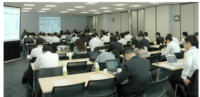
Briefing on the financial results for the term ended March 2014

For the sake of institutional investors and security analysts, we organize quarterly briefings on financial results, meetings on individual matters, and other activities in an attempt to promote better understanding of our Group.