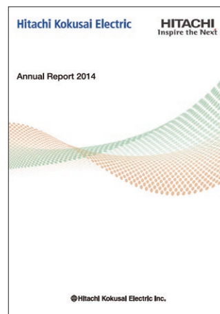
Annual Report 2014

As for the information on corporate finance and governance, we post the PDF version of “Annual Reports” to our global website, and disclose quarterly reports on the same site. Our Japanese website alternatively provides equivalent financial and other reports and interim reports in Japanese.