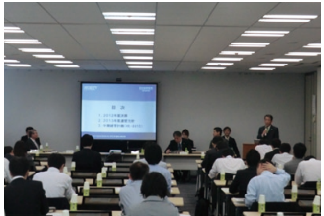
Briefing on financial results for the term ended March 2013

For the sake of institutional investors and securities analysts, we organize quarterly briefings on financial results, meetings on individual matters, and other activities in an attempt to promote better understanding of our Group.