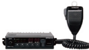
Land Mobile Radio Communication Product