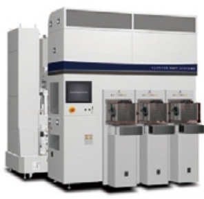
Single Wafer Plasma Nitridation/Oxidation Equipment