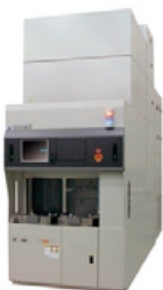
Batch SiGe/Si Epitaxial Growth Equipment