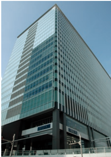
Headquarters (Akihabara UDX Building, 11th floor)

Name Hitachi Kokusai Electric Inc. Address of Head office 4-14-1, Soto-kanda, Chiyoda-ku, Tokyo 101-8980, Japan Established November 17, 1949 Paid-in Capital ¥10,058 million Net Sales ¥138,801 million (consolidated) Employees 5,193 (consolidated)