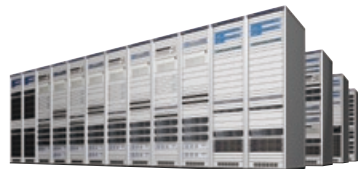
Tapeless Servers System (Server system for broadcasting station operation)