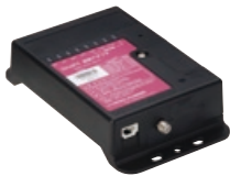
Wireless Packet Communication Unit for Cellular System

Wireless Communication Systems, Information Solutions, Broadcasting Systems, Video Processing Systems and Cameras