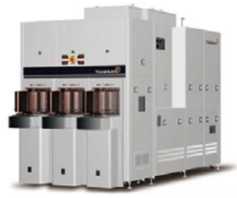
Single Wafer Ashing Equipment