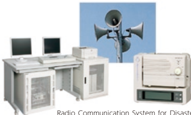
Radio Communication System for Disaster Preventive Administration