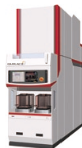
Batch Thermal Process Equipment