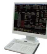
Securities Information Display System