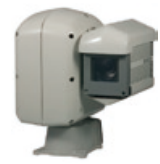
Integrated Pan/Tilt Camera for Outdoor Use