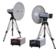
Broadcasting Video Transmitter (Microwave Link)