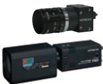
Industrial Video Camera