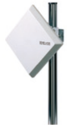
High-speed Wireless Repeater