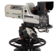
Broadcasting HD Video Camera