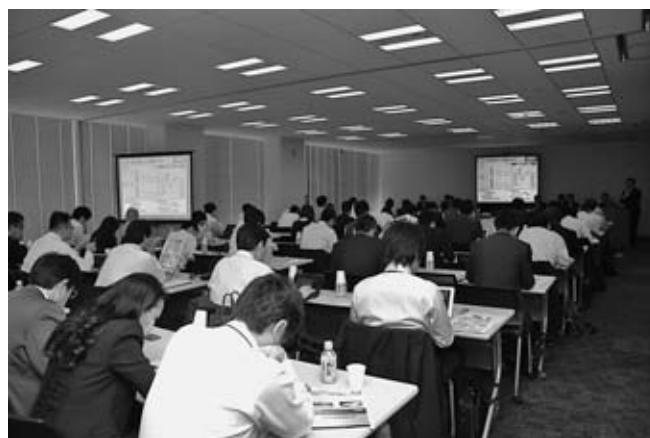
Briefing on financial results for the term ended March 2012

For the sake of institutional investors and securities analysts, we organize quarterly briefings on financial results, meetings on individual matters, and other activities in an attempt to promote better understanding of our Group.