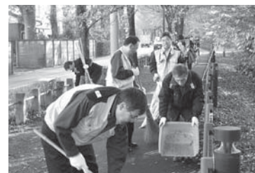
Cleaning on the Tamagawa Josui canal promenade

On that day, for about 30 to 60 minutes before the start of work and in the midst of the refreshing early morning air, all participants enthusiastically cleaned up the dead leaves of autumn and picked up cigarette butts.