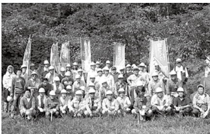
All participants together after work

While receiving support from the prefecture, the municipal and an environmental protection association, we joined a woodland nurturing activity of conserving about two hectares of forest in the Toyama Yatsuo Central Industrial Park, which is a city-owned area. Fiscal 2009 saw such activities as weeding, thinning out shrubs and branches, maintaining trails and planting trees being undertaken on a total of seven occasions.