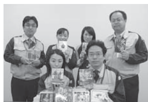
Participant members who brought disused books

Our group cooperated with the NGO engaged in such activities, and collected disused books on a group-wide basis. This originated with the proposal of a colleague and was grown group-wide as "a social contribution activity that anyone can easily join." It was a first attempt, but colleagues were interested and we managed to collect many contributions. We intend to continue conducting such activities periodically for "contributing to society" and "streamline the office stock" by finding venues for disused things.