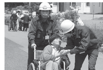
Assisting the evacuation of wheelchair users

On May 26, 2009, the prefectural day of the disaster prevention, Goyo Electronics Co., Ltd. participated in joint evacuation drills at a special care facility for the aged "Shokei-en" which concluded a "Treaty of cooperation in emergency measures against fires and disasters" with us. The drills were joined by a total of 23 members of the self-defense fire-fighting team and General Affairs Department, who assisted in evacuating people in wheelchairs in the five zones of the care facility. With regard to wheeling speed, curbstone passing, slope traveling, and other points for attention when assisting people in wheelchairs, we were instructed beforehand and managed to guide all the evacuees safe and sound, without making them anxious, onto the premises of Goyo Electronics Co., Ltd., the presumed evacuation shelter. The evacuation drills in a situation different from ordinary drills constituted a very significant experience for team members as well, and the smiles shown by the residents at the time of said transport were considered an irreplaceable expression of thanks. In the future, we intend to conduct these joint evacuation drills in an attempt to become a corporation that wins the confidence of the community.