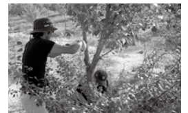
Pruning in a cultivated forest

In September 2009, the volunteer experience tour as part of the Horqin Desert Greening Project in China (arranged by the CSR Promotion Department, Hitachi, Ltd.) was joined by one member of our Company, together with colleagues and their families from among other members of the Hitachi Group, totaling 25 people. At a village about a three-hour drive north from Shenyang Taoxian International Airport, the participants experienced various tasks such as combating desertification and cultivating saplings, thereby working to engage in exchange with rural areas and college students in the local community.