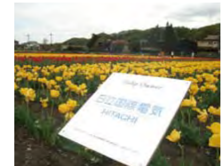
Hamura Flower and Water Festival (2)