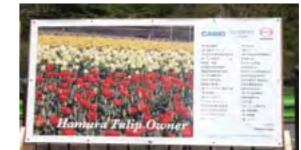
Hamura Flower and Water Festival (1)