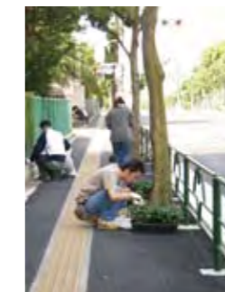
Full Bloom Campaign