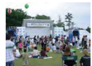
"Goyo Electronics Co., Ltd." and "Temporary Parking Place"