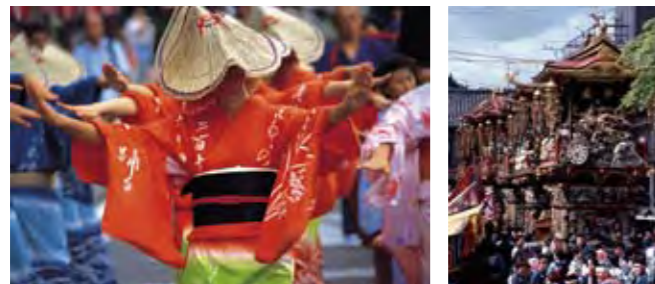
Owara Kaze no Bon Festival

To maintain harmony with the community and to reserve its tradition, the Works contribute donations to "Hikiyama Festival" and "Owara Kaze no Bon Festival."