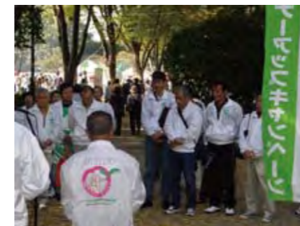
Smoking Manner-up Campaign

To help reactivate the community, employees of the Works cooperate and participate in the volunteer work for "Hamura Flower and Water Festival (March and April)", "Full Bloom Campaign (May)", "Summer Festival (July)" and "Smoking Manner-up Campaign, Industrial Festival (November)."