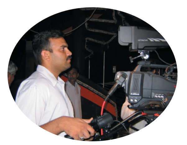
Pakistan TV staff before the disaster operating the camera of the same model as donated

message that the audience in Kashmir would never forget this kindness arrived to us through that TV station and raised an expectation to further deepen the friendship between the two countries in the future. The Pakistan TV station has been using our broadcasting cameras for over 20 years. Almost all of the pictures distributed from Pakistan are produced by means of our cameras. Hitachi Kokusai Electric sincerely wishes the speedy recovery of the Muzaffarabad and Jammu & Kashmir branches and life of inhabitants of those areas from damage.