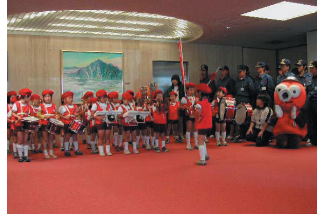
A firefighting team composed of 35 children from Fukushima Nursery School participated in a joint evacuation drill held at Toyama Works with local fire-fighting station team. (November 9, 2005)

The playground at Toyama Works is put to use by local baseball teams. Among middle school players who had trained here, many won opportunities to participate in high school baseball games at the Koshien. On August 27 and 28, 2005 "Baseball Games battling for Toyama TV Cup" by the Toyama Senior Leagues were held at this playground.