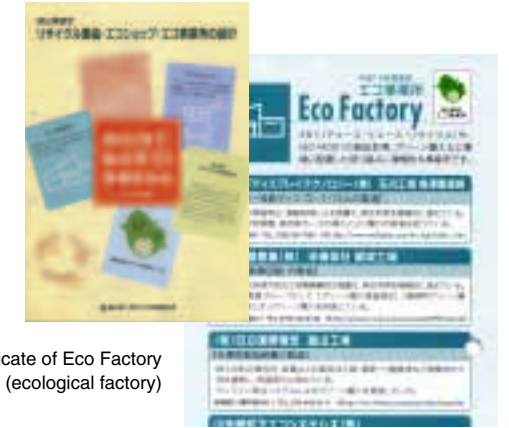
Certificate of Eco Factory (ecological factory)