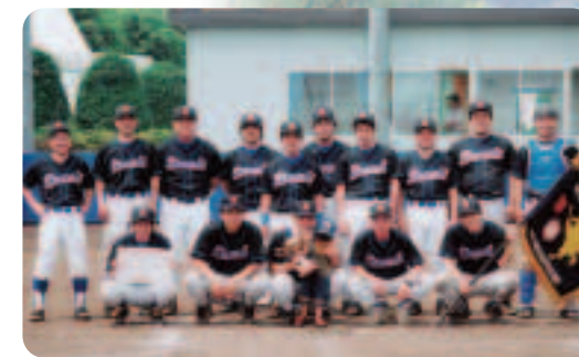
Captured a championship of League 1 in Muzuho-cho rubber ball-baseball spring series