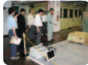
Safety diagnosis by Central Disaster Prevention Association