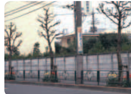
Flower campaign across the city of Hamura

Hitachi Kokusai Electric aims at harmonious coexistence with local communities, and each of our factories is involved in various social action programs, cooperating with local governments and various organizations in the community.