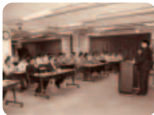
Seminar on mental health