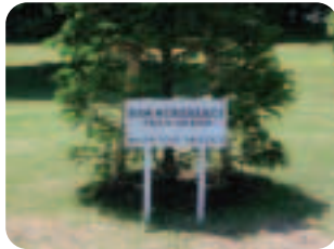
The memorial tree planted to celebrate Hamura works' no-disaster record for 23.7 million hours