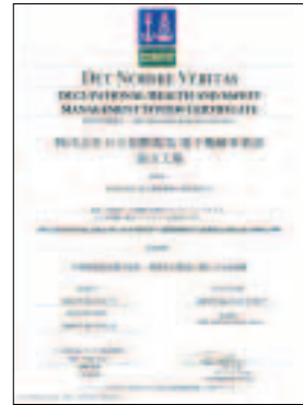
Registration certificate of Toyama Works

Also, not only manufacturing sites, but also our affiliated company, Kokusai Electric Semiconductor Service Inc. that engages in installation and related services was certified in July 2003.