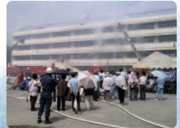
Participated in general disaster prevention training in Kodaira City