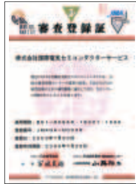
Registration certificate of Kokusai Electric Semiconductor Service Inc.