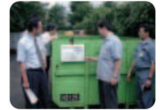
Environmental audits at Hamura Works