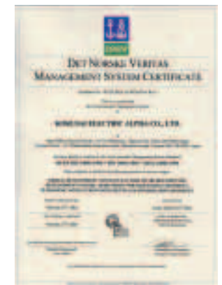
Registration Certificate for Kokusai Electric Alpha Co., Ltd.