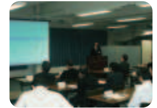
Presentation meeting for environment-friendly design examples