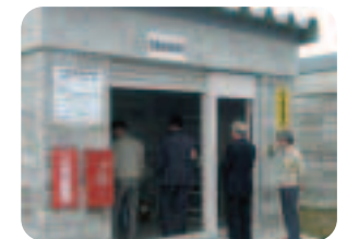
Kokusai Denki Engineering Co., Ltd. Environmental audits at Akita Works