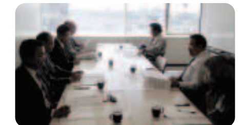
Environmental management operational committee meeting